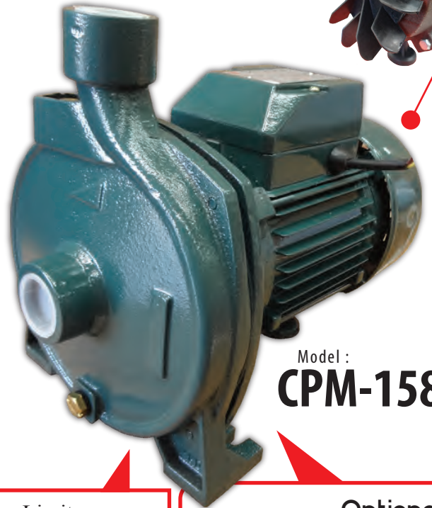
Model : CPM-158