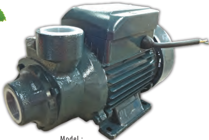
Model : PKM-60