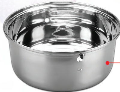
* Stainless Steel Bowl